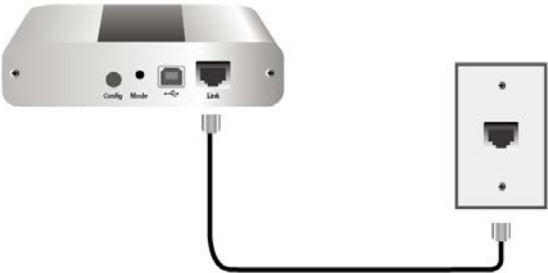
1. Connect the local unit and the LAN port with the Cat 5e cable.