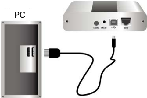
2. Connect the Local Unit to the PC using the USB A-B cable.