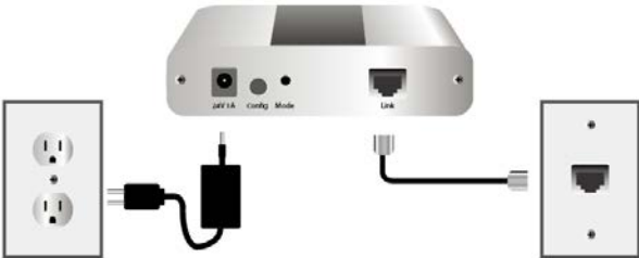
3. Connect the AC adapter to the Remote unit . Then connect the Remote unit to the LAN port with Cat 5e cable.